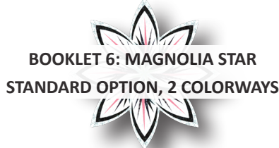
BOOKLET 6: MAGNOLIA STAR STANDARD OPTION, 2 COLORWAYS