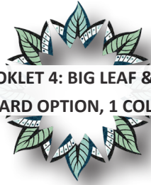
BOOKLET 4: BIG LEAF & LILY STANDARD OPTION, 1 COLORWAY