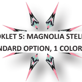
BOOKLET 5: MAGNOLIA STELLATA STANDARD OPTION, 1 COLORWAY