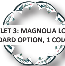
BOOKLET 3: MAGNOLIA LOEBNER STANDARD OPTION, 1 COLORWAY