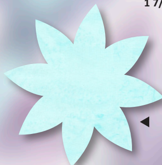
S2, S5, S7, S10, S12, S15, AP6:b, C9:b, E2 ICICLE 1 yd