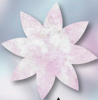
AP6:a, S3, S8, S9, S14, C9:a, E3 TEA ROSE 7/8 yd