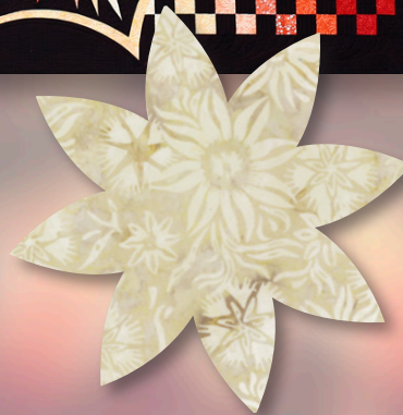
▲ A6:b, B1, AP1, AP2, AP3, AP4, AP5 TONGA-B8163-JASMINE 5/8 yd