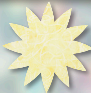
▲ D4, D9 TONGA-B8162-HALO 3/8 yd