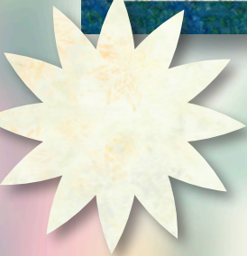
▲ C1, J5:a, J5:b, J5:c, F1 TONGA-B6168-AIR 4 1/4 yd