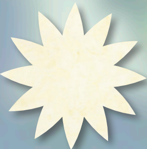
▲ D11, E1 TONGA-B7900-GHOST 2 1/4 yd