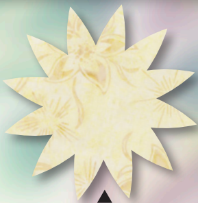
▲ B1, D7, D10 TONGA-B8786-IVORY 7/8 yd