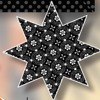
▲ S5 8241-J 1/8 yd