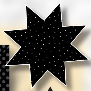
▲ B2, B3 8210-J 3/4 yd