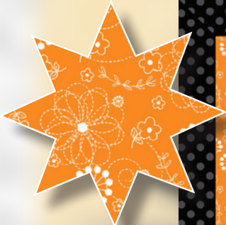
▲ C2 8246-O 1/4 yd