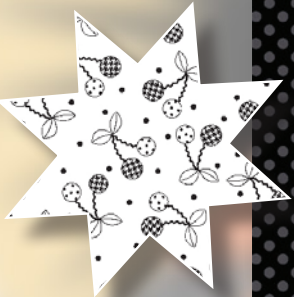
▲ C3 8245-J 3/8 yd