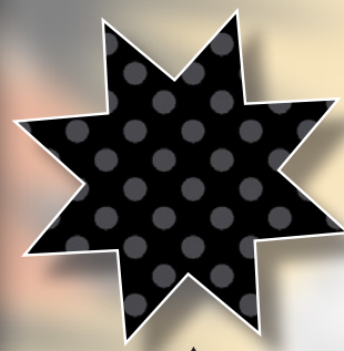
▲ S1, C1 8216-JK 5/8 yd