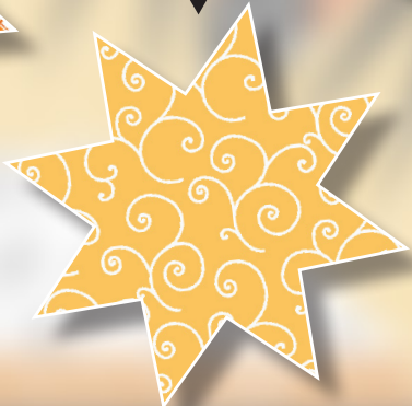
▼ B1 8243-S 7/8 yd