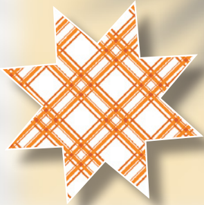
▲ S3, S7 8244-O 1/4 yd