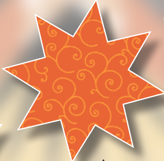
▲ S2, S4, S6, S8 8243-OO 3/8 yd