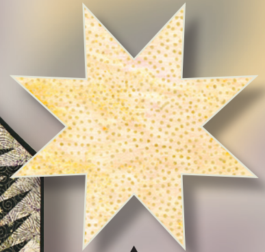
▲ C1 Doughnut 1/2 yd